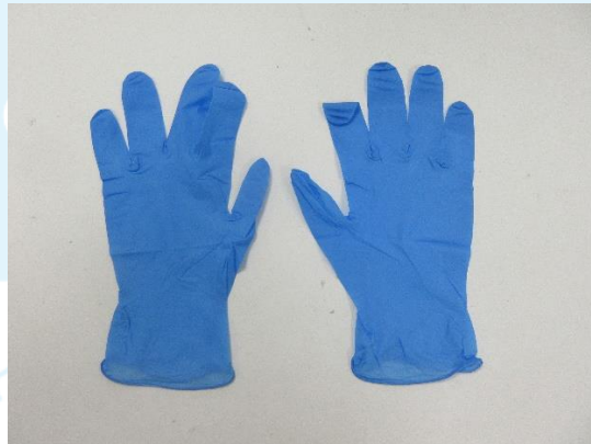
Samples described as 2.2mil (2.7g-3.1g) Powder Free Nitrile Examination [Regular blue]