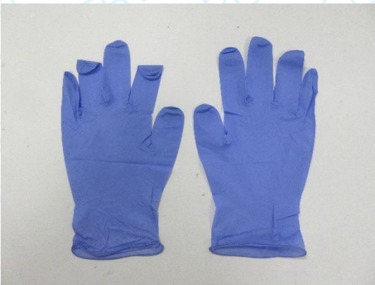
Samples described as 2.2mil (2.7g-3.1g) Powder Free Nitrile Examination [Purple blue]

A handwritten signature in black ink, appearing to be 'J. H.', written over a horizontal line.